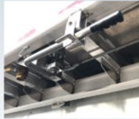
Manual Gate Handle