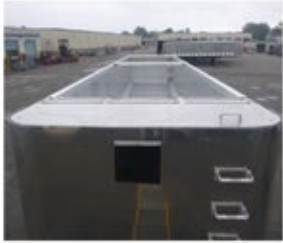
Front & Rear Splash Shield