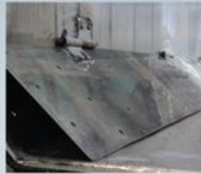
Perforated Hinged Cleanout