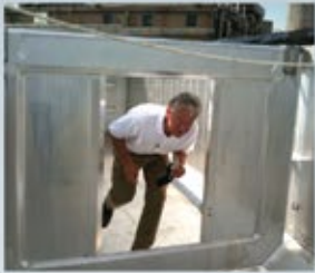
Walkthrough Center Gate/Baffle