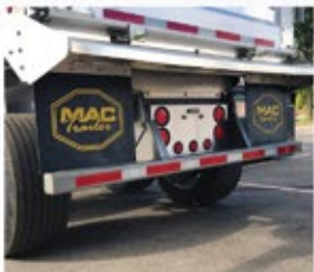
Bolt on Hinged Bumper