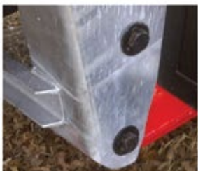
Galvanized Suspension Hangers

14599 Commerce Street, Alliance, Ohio 44601 1-800-795-8454 Corporate Office www.MACtrailer.com