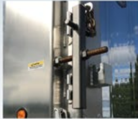
Gate Safety Winder