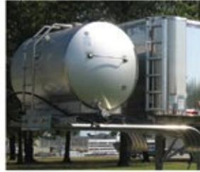
Stainless Steel Blood Tank

For more information on MAC Rendering Trailers please call 1-800-795-8454